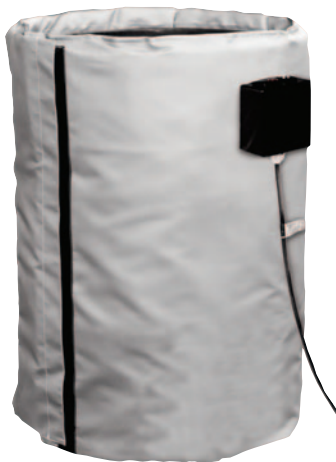
55 Gallon Single Zone Full Coverage