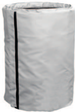
55 Gallon Drum Full Coverage Insulation Blanket