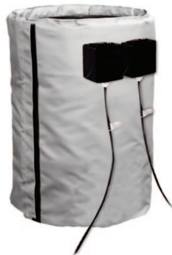
55 Gallon Dual Zone Full Coverage

Dual Zone Drum Blanket Heaters include two independently controlled and wired heater sections for better uniformity, control and higher wattage.