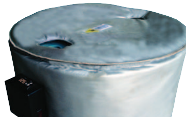
Insulation Cover with openings for bung hole and vent