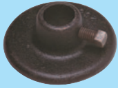
FLG-122-101 FLG-122-102 FLG-122-103