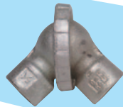
FTG-150-101 FTG-150-102 FTG-150-103