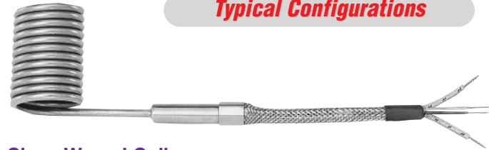
Close Wound Coil