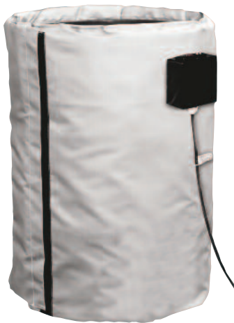
55 Gallon Single Zone Full Coverage