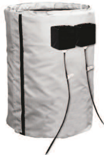
55 Gallon Dual Zone Full Coverage

Dual Zone Drum Blanket Heaters include two independently controlled and wired heater sections for better uniformity, control and higher wattage.