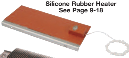
Silicone Rubber Heater See Page 9-18