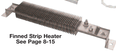
Finned Strip Heater See Page 8-15