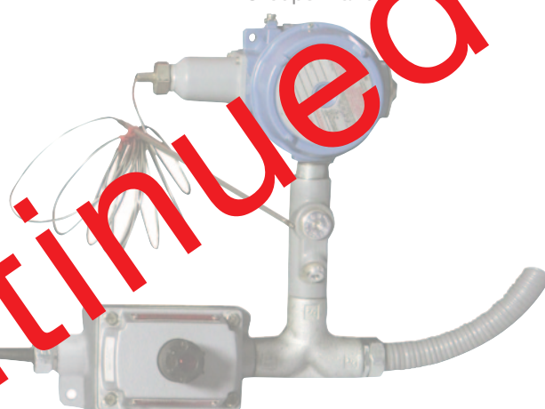
NEMA 7 Thermostat Control Assembly with High Limit Indicator Lamp

Class I Division 2: Groups A, B, C and D Class II Division 2: Groups F and G