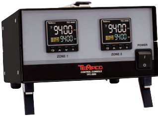
Model TPC-2000 2-Zone Control Console 4-7/8" H x 9" D x 8-1/4" W