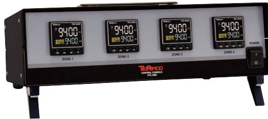
Model TPC-4000 4-Zone Control Console 4-7/8" H x 10" D x 14-13/16" W