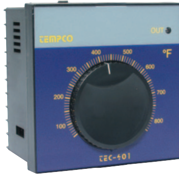
Low Cost Non-Indicating Control!