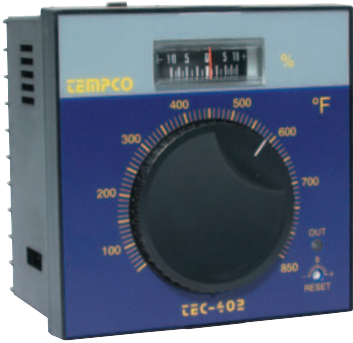
With Process Temperature Deviation Meter!