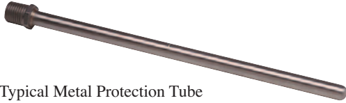
Typical Metal Protection Tube

protecting tube or well. Metal tubes selected to suit the temperature, pressure and atmosphere are generally used with base metal thermocouples.