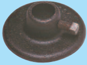
FLG-122-101 FLG-122-102 FLG-122-103