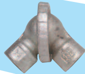
FTG-150-101 FTG-150-102 FTG-150-103