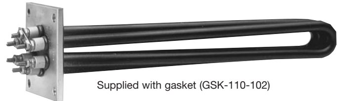
Supplied with gasket (GSK-110-102)