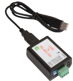
Part Number TEC99928