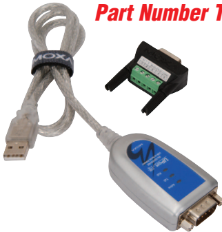
Part Number TEC99927