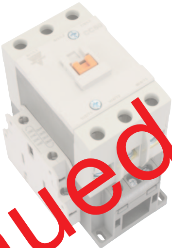
3-Pole, 70 & 100 Amp