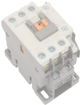
3-Pole, 25 & 40 Amp