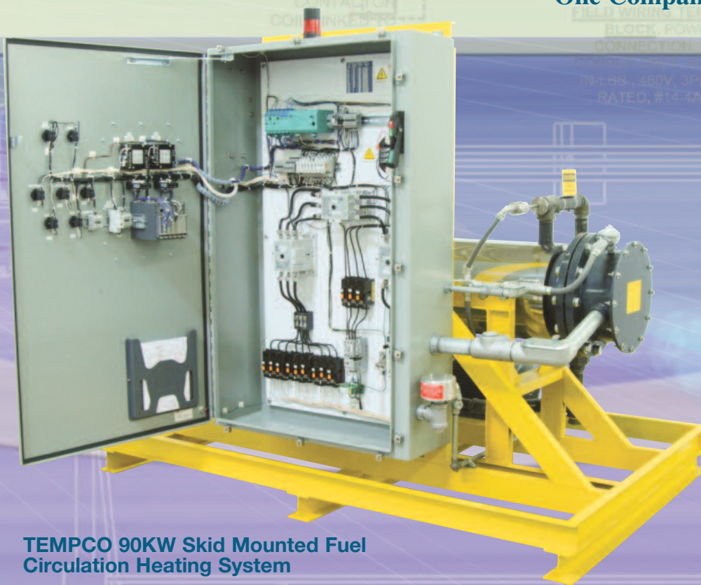
TEMPCO 90KW Skid Mounted Fuel Circulation Heating System

Achieve your goals with TEMPCO. One Company, One Solution.