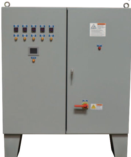
Five-stage heater control panel with PC controlled SCR for Class 8 truck wind tunnel testing.