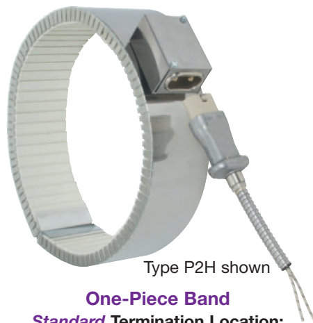
Type P2H shown