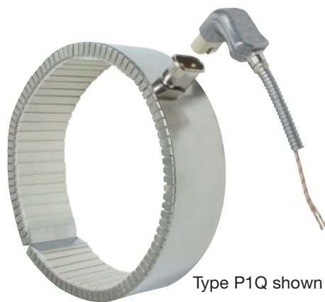
Type P1Q shown