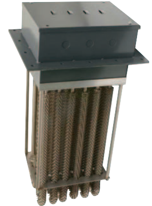
Finned Duct Heater

D Standard field replaceable elements are held in place with single-screw quick-release "V" clamps. Pressure resistant designs utilizing welded elements, bulkhead fittings, or compression fittings to attach elements to the flange are available to limit leakage of ducted air or gases into the terminal enclosure. Welded elements are used for gas tight applications.