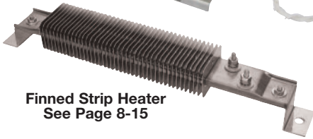
Finned Strip Heater See Page 8-15