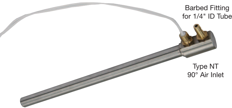
Barbed Fitting for 1/4" ID Tube