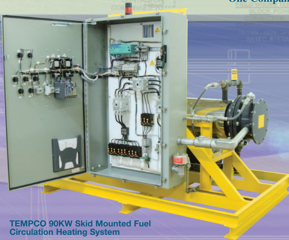
TEMPCO 90KW Skid Mounted Fuel Circulation Heating System

Achieve your goals with TEMPCO. One Company, One Solution.