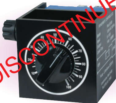
Surface Panel Mount 10 Amp Unit

Tempco's Solid State Variable Power Controllers are an excellent value for your power controlling needs. Used in an open loop, non-feedback control system, these power controllers regulate input versus output voltage for controlling any of a number of processes where a fixed applied voltage is desired. The solid state technology allows these controllers to be smaller and lighter than ever, and useful in areas where variable voltage transformers are not a viable choice.