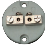
2-Terminal Ceramic Block P/N: TCA-116-101