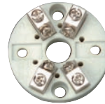
4-Terminal Ceramic Block P/N: TCA-116-104