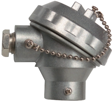
3-1/2"H x 4"L x 3-1/4"W