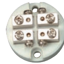
4-Terminal Ceramic Block P/N: TCA-116-106