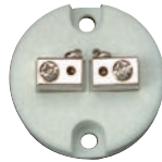
2-Terminal Ceramic Block P/N: TCA-116-103