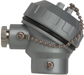
3-1/2"H x 3-3/4"L x 2-5/8"W