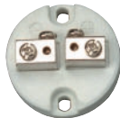
2-Terminal Ceramic Block P/N: TCA-116-105