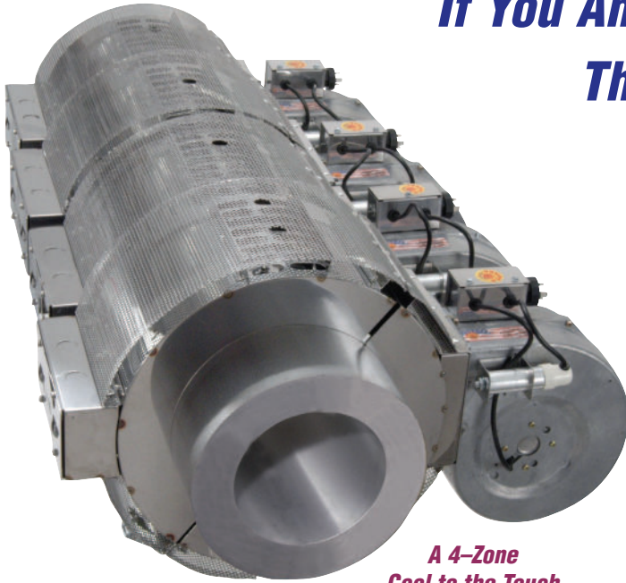
A 4-Zone Cool to the Touch Shroud System

Let Tempco's state-of-the-art technology convert your extruder's existing heating and cooling system from antiquated, inefficient and costly to modern, highly efficient, and cost-effective.