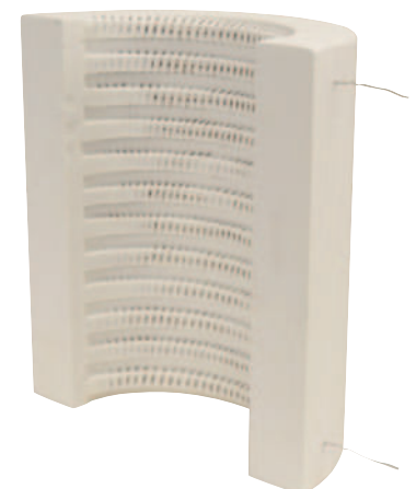
High Temperature (1200°C) Semi-Cylindrical Heater

7" I.D. × 11" O.D. × 12" Long 1600W, 240V