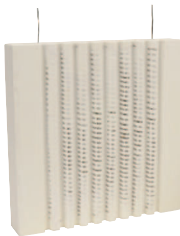
High Temperature (1200°C) Flat Panel Heater

2" I.D. × 6" O.D. × 18" Long 1130W, 240V