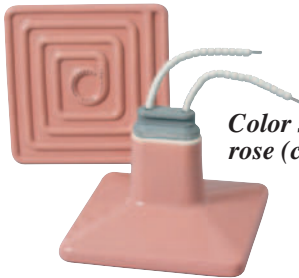
Color shown is rose (cold) to grey (hot)