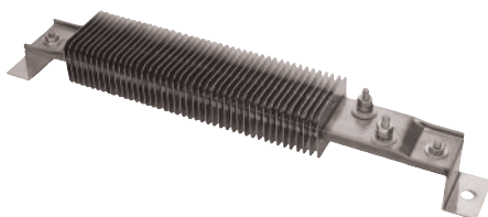
Finned Strip Heater See Page 8-14