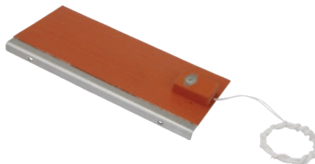
Silicone Rubber Heater See Page 9-18