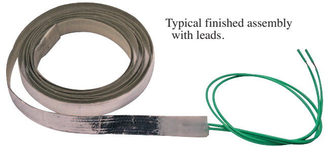
Typical finished assembly with leads.

1 Conductor Tape 1/6" (4.2 mm) wide; can wrap down to .060" (1.52 mm) O.D. A lead will be present at both ends.