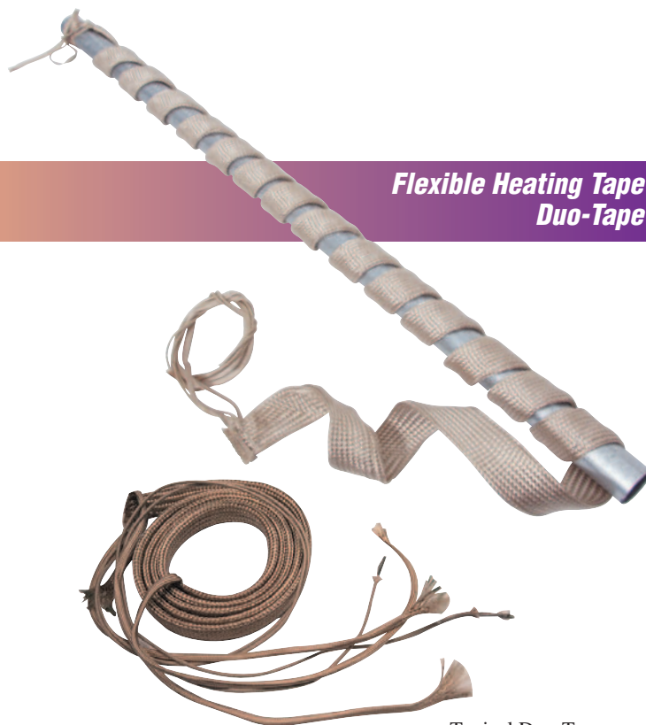
Flexible Heating Tape Duo-Tape